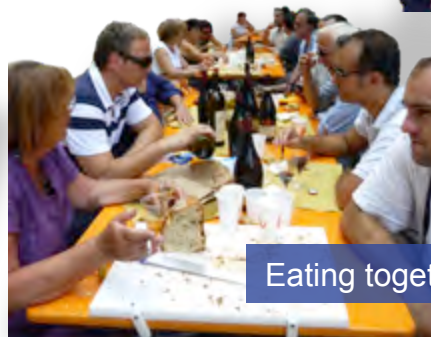
Eating together: the Convivial Tables