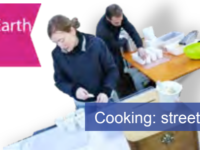
Cooking: street food