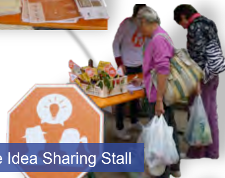
Co-designing: the Idea Sharing Stall