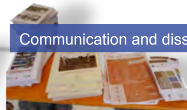
Communication and dissemination